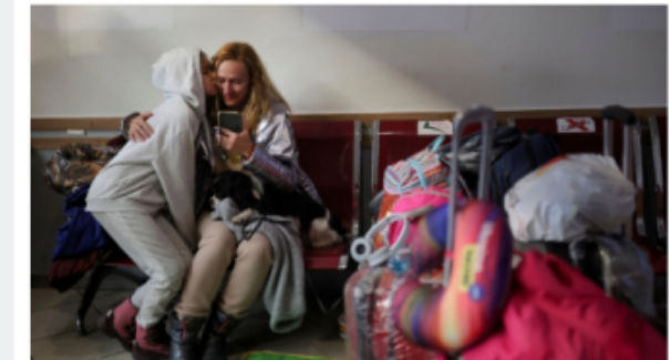
A mother and daughter who fled their home in Ukraine after arriving at a railway station in Bucharest, Romania

Asylum seekers are usually not permitted to do jobs or apply for benefits – but more generous rules will apply to those coming from Ukraine under the Government's sponsorship scheme