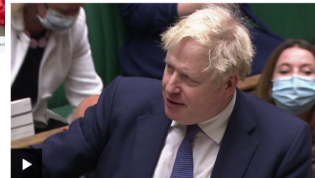
Watch: PM confirms Plan B will stay, as England sees fastest growth in Covid cases

England's current Plan B rules will continue for now, Boris Johnson has confirmed - as new figures show a record one in 15 people had Covid on New Year's Eve.