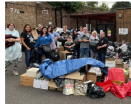
Some of the items that were donated to Surry United Synagogue in Harlow for Afghan families.